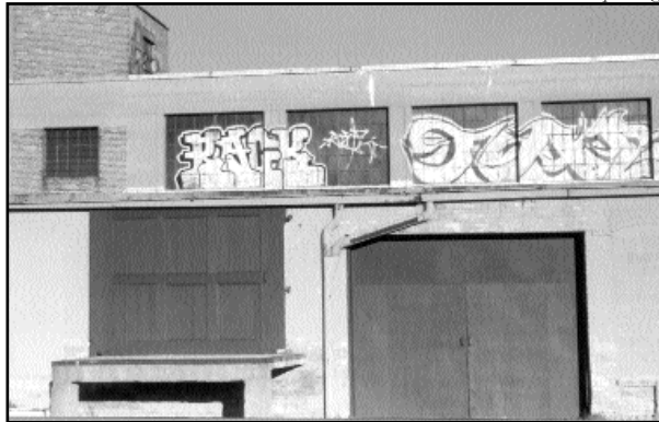
Graffiti often appears in hard-to-reach yet highly visible locations, such as on the upper-story windows of this warehouse.

In addition, two types of surfaces attract graffiti: