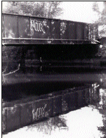
Graffiti offenders risk injury by placing graffiti on places such as this railroad bridge spanning a river.