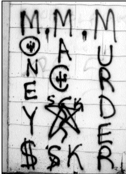
Gang graffiti marks territory and conveys threats.

In areas where graffiti is prevalent, gang and tagger graffiti are the most common types found. While other forms of graffiti may be troublesome, they typically are not as widespread. The proportion of graffiti attributable to differing motives varies widely from one jurisdiction to another. § The major types of graffiti are discussed later.