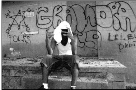
Young male gang members may engage in a substantial amount of graffiti.

Graffiti offenders typically operate 10 in groups, with perhaps 15 to 20 percent operating alone. In addition to the varying motives for differing types of graffiti, peer pressure, boredom, lack of supervision, lack of activities, low academic achievement, and youth unemployment contribute to participation in graffiti.