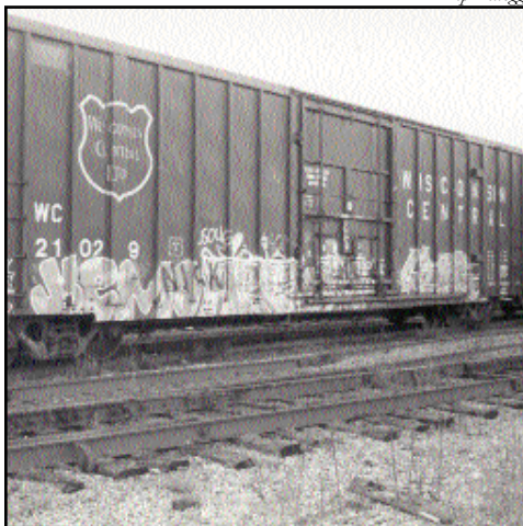
Graffiti is commonly found in transportation systems, such as on the side of this railroad car.

§ Most sources suggest that paint-over colors should closely match, rather than contrast with, the base. Contrasting paint-overs are presumed to attract or challenge graffiti offenders to repaint their graffiti; the painted-over area provides a canvass to frame the new graffiti.